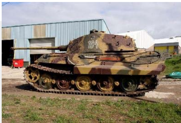
Pz VI B in three color disruptive camouflage