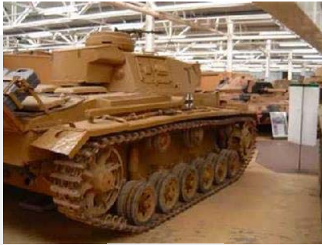
Pz III - Afrika - Gelbbraun

March 1942: - Yellow-brown and sand paint (Gelbbraun RAL 8020 & Sandgrau RAL 7027) were made available to be used once current stocks of Gelbbraun and Graugrün ran out. The colors were to be applied using two-thirds to one-third ratio (yellow-brown to sand) with feathered edges.