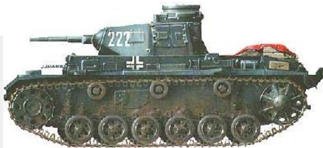
Pz III Early War - Dunkelgrau