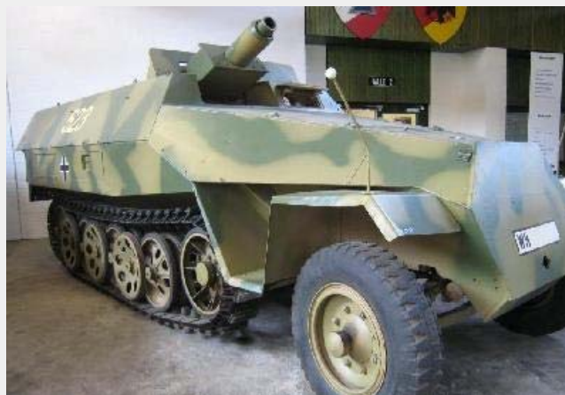
Late Pattern Camouflage of Dunkelgelb & Olivgrün

1944+: - By late 1944, the Germans had been pushed back into Eastern Europe and the camouflage schemes for the last year of the war followed the patterns used in the European Theater.