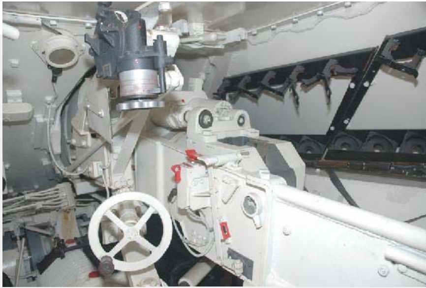
Hetzer Interior (looking forward)