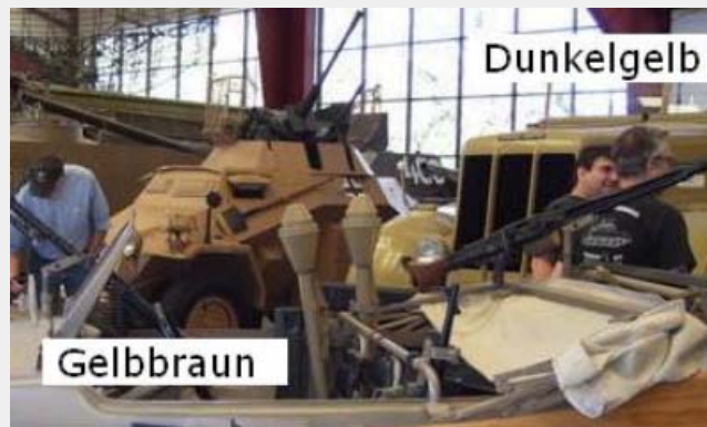
Gelbbraun vs. Dunkelgelb

You may note that I have only included one version of Dunkelgelb (dark yellow). That name was applied to two separate colors during the war. Historians have trouble agreeing on what they looked like, so I have chosen to treat them as a single color. In a similar note, this is not intended as a scholarly article, but as a guide for miniature painters so I have dispensed with the various name and designation changes some colors went through.