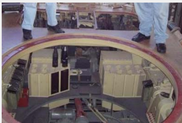
Interior of a Panther A (turret removed, looking forward)