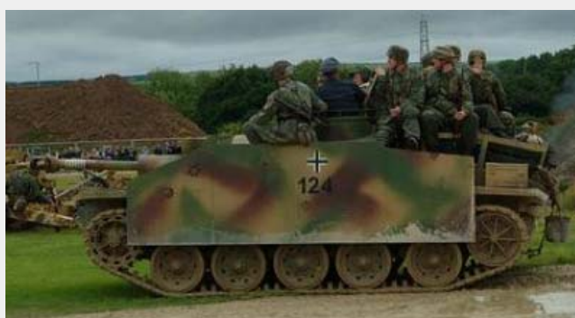
Replica StuG III in three color disruptive camouflage