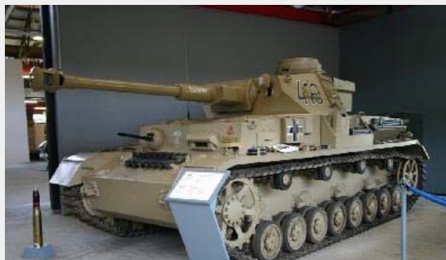
Pz IV DAK

March 1941: - Vehicles in Africa were to be painted yellow-brown (Gelbbraun RAL 8000) and grey-green (Graugrün RAL 7008) using two-thirds to one-third ratio.